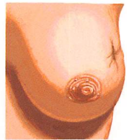
Dimpling of skin

As cancer grows, it can change how your breast looks.